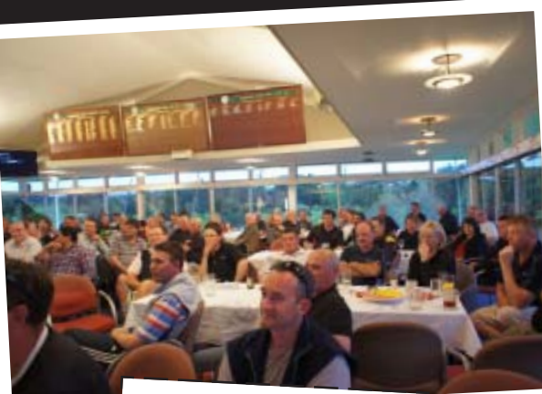
Let the Auction Begin